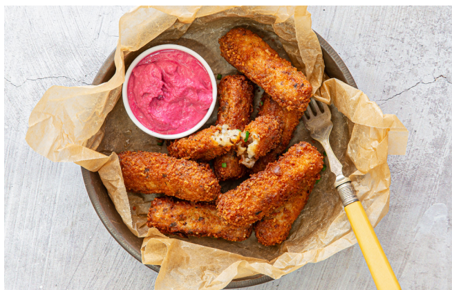
SHIITAKE MUSHROOM, TRUFFLE & TALEGGIO CROQUANCINI™