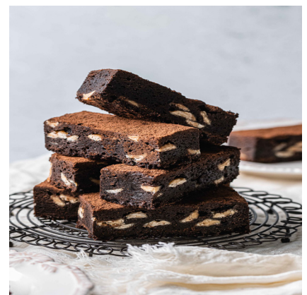
TRIPLE CHOCOLATE BROWNIE