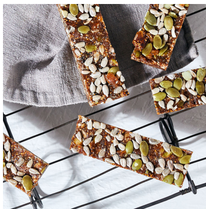
FRUIT & SEED BAR