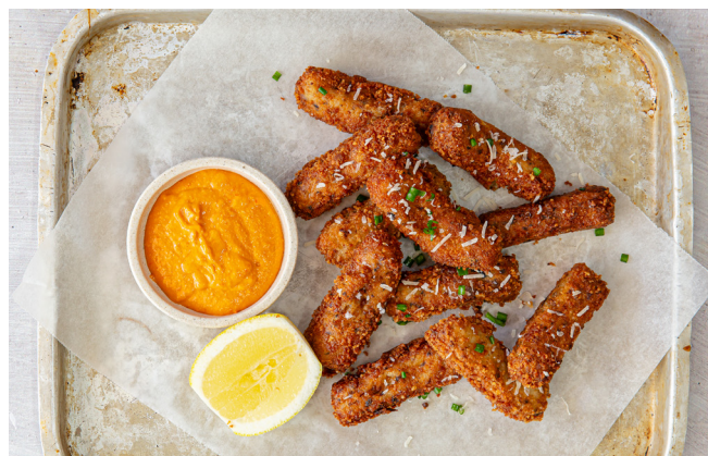
KALE, QUINOA & PUMPKIN CROQUANCINI™