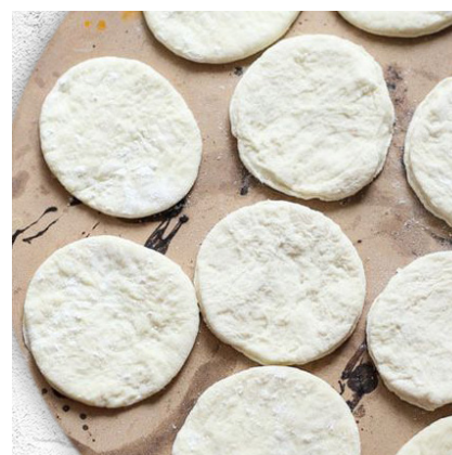
MINI PIZZETTE PLAIN BASE 2.5"